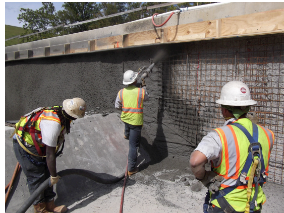
Lake James Spillway