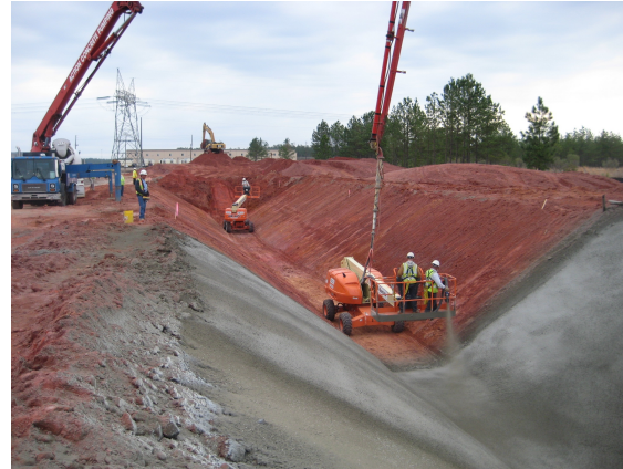
Vogtle Nuclear Plant

Examples of our work include a large drainage ditch at Plant Vogtle; a shotcrete overlay for the Lake James Spillway and a soil nail wall for a large manufacturing plant addition. Click here to view test panels being shot during the field test portion of certification.